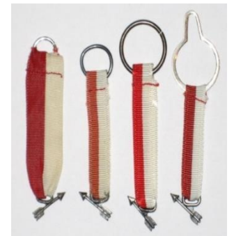
Examples Universal Arrow Ribbon

The Universal Arrow Ribbon, a red and white ribbon suspending a silver arrow originally pointed over the wearer's left shoulder