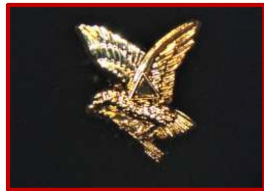
Vigil Honor Pin